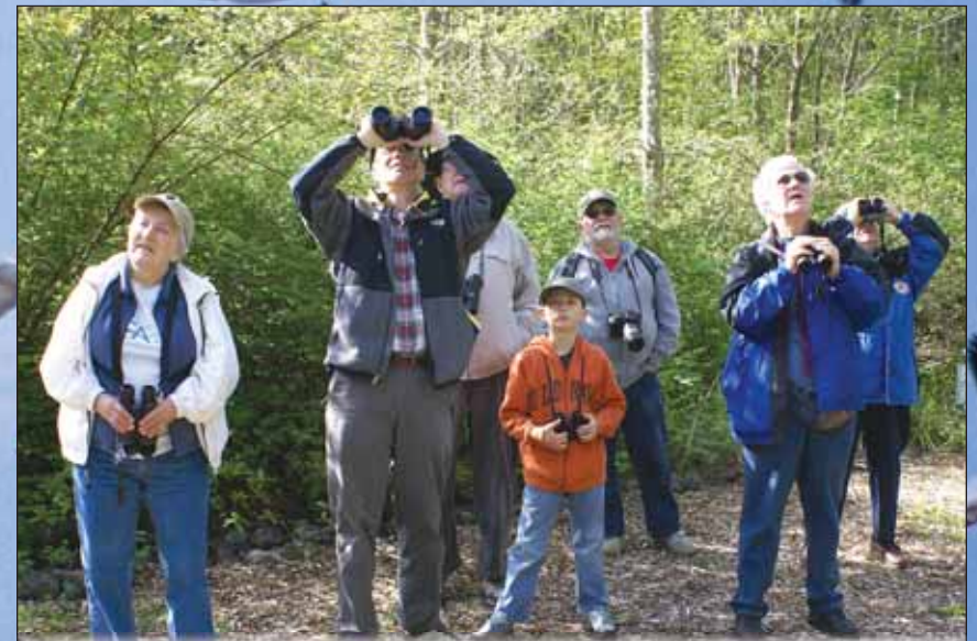
Famous for its picturesque lighthouse, Point-No-Point County Park and adjoining wetlands are an internationally recognized IBA (Important Bird Area). The Kitsap site is an important stopover for migrating birds and wintering waterfowl.